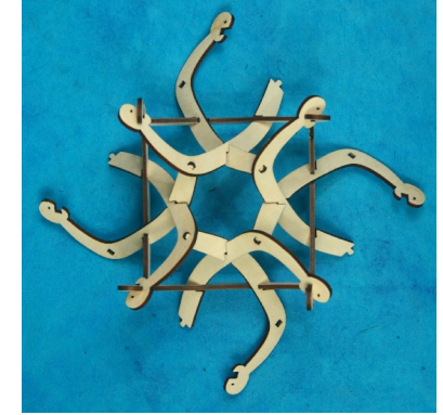
3. Continue adding parts one at a time, with tail-to-hole squares, down-notches. Above, it is half done (12 parts), after which it is easy to continue following the pattern.

4. At every step, check each tail is fully in its intended hole, each notch fully mates its partner notch, and each headto-head kiss is intense. Only a slight flex is needed to insert the final parts, so be careful not to snap anything. Though it all tends to fall apart in the initial stages, it is extremely stable when complete. Notice there are six squares, but they are not arranged edge-to-edge like the six squares of a cube!