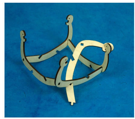
1. Make a square of four parts, inserting tails into holes in a cycle. Add a fifth part connecting mouth to mouth and notch to notch. The parts flex just slightly, so springiness and friction hold it together.